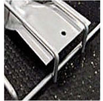
Waterfall Box Beam. Structural & step beam applications.

At Novalok we carry an assortment of wire mesh decks as an alternative to safety bars. Each mesh deck has a capacity rating that exceeds 2,000 lbs UDL (uniform distributed load) This means that it can carry 2,000 lbs as long as the load is distributed along the entire surface of the mesh deck, and not on any one particular smaller area, commonly referred to as a point load.