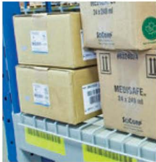
Wire mesh decks for box beam with waterfall.