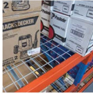
Inboard wire mesh deck for step beam.